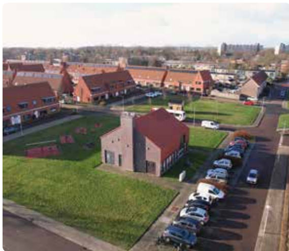
residential area Noorderhoek, 207 houses, Sneek, NL

After the treatment the water can be reused or released to surface water.