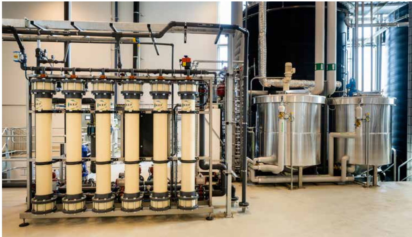
wastewater treatment plant for City of Helsingborg, RecoLab, Sweden, 2100 persons