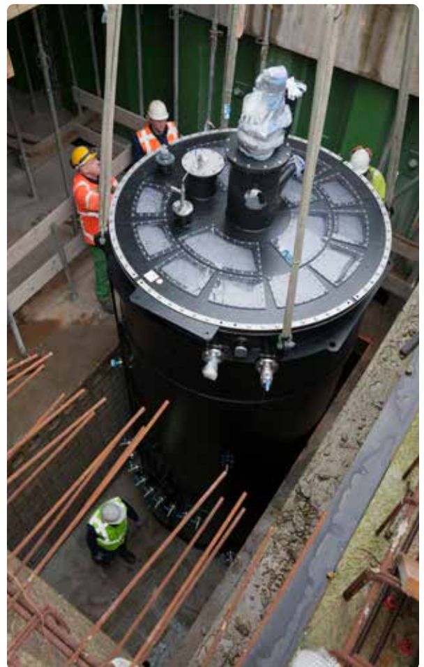
black water reactor for government office building, The Hague, NL

Our concept has several advantages compared to conventional, centralized wastewater and green waste treatment systems. Such as, lower water consumption due to water saving toilets/vacuum toilets (1-liter flush), lower energy consumption due to heat recovery from the wastewater treatment process, the possibility to recycle water on a neighborhood level, the recovery of valuable fertilizer, and an overall decrease in dependency of central power and water grids. This approach to wastewater treatment at the district level is also known as “New Sanitation”.